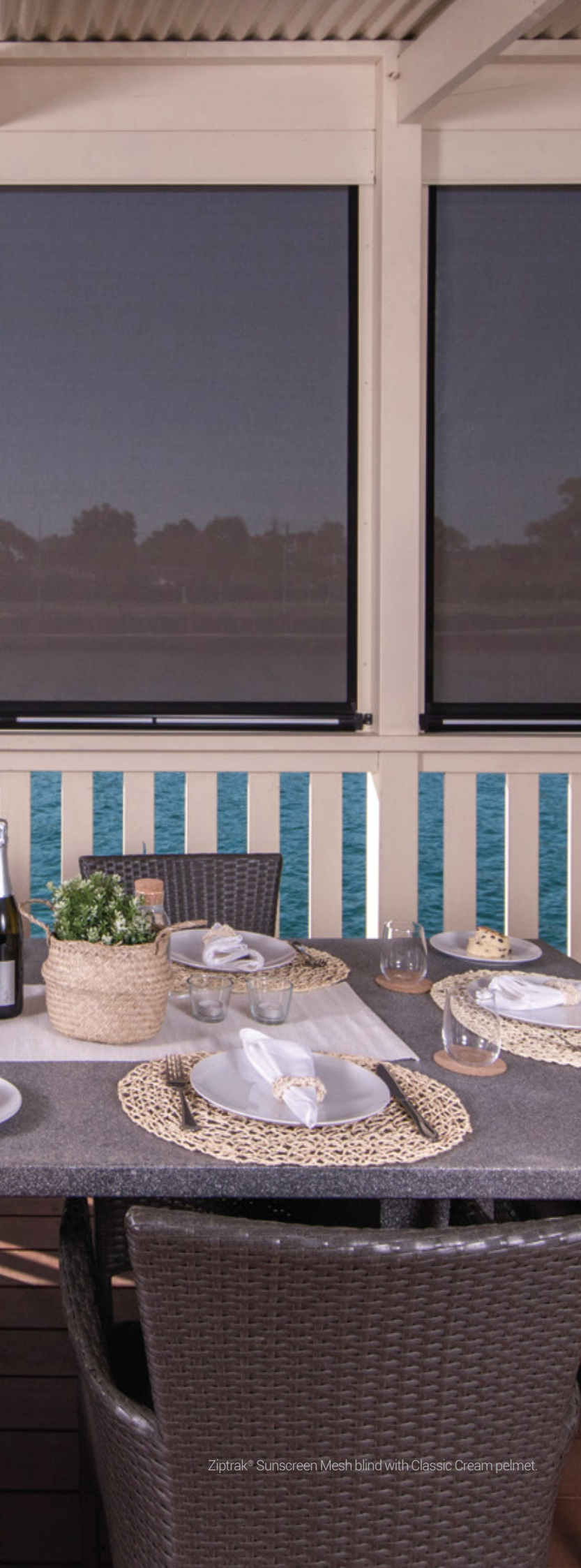
Ziptrak® Sunscreen Mesh blind with Classic Cream pelmet.

Instantly transform your space to create a sense of seclusion and sanctuary. You'll spend more time enjoying life outdoors with family and friends.