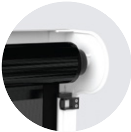
CAST BRACKET WITH BACK FLASHING